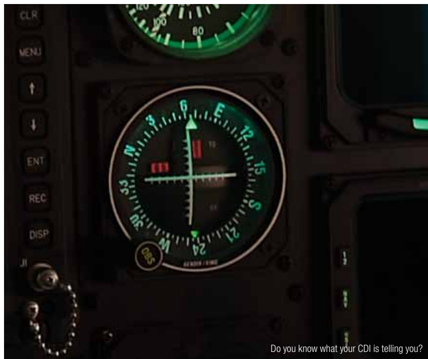
Do you know what your CDI is telling you?

For those of you who have had the pleasure of “chasing the needle” on a non-precision GPS approach, you are hopefully familiar with the varying levels of sensitivity seen on your course deviation indicator (CDI) throughout the various stages of the approach. What you may not realize is that CDI sensitivity varies between older, “traditional” GPS receivers and new WAAS (Wide Area Augmentation System) capable receivers. That means which type of receiver you are using can have an important impact on how you fly the approach.