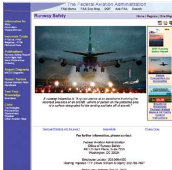
Figure 1: This Runway Safety Web site provides information, exercises, and links about runway safety issues.

FAA Office of Runway Safety One way to get the most from your hard-earned tax dollars is to take advantage of the many resources available on this part of the FAA’s Web site www.faa.gov/runwaysafety/ (see Figure 1). An interesting place to start is the link on the lower right, called “Situational Awareness Through Airfield Signs & Air Traffic Control