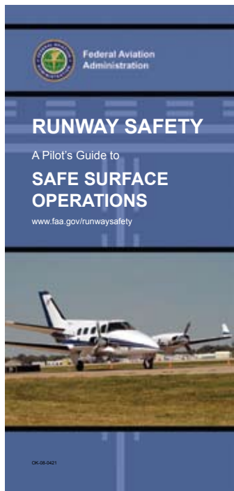
Figure 3: This pilot's guide to safe surface operations should be in every pilot's flight bag. If you are planning on flying to an unfamiliar airport or to one more complex than your home airport, it can help prepare you for the flight.

brings up another set of interactive runway safety exercises. The "Airport Taxiway Marking Review" allows you to assess your understanding of some of the airfield markings you are likely to encounter while taxiing. The "Taxi Instruction Self-Assessment" exercise allows pilots to assess their understanding of "taxi to" instructions from air traffic control. There are also "Situational Awareness" sce-