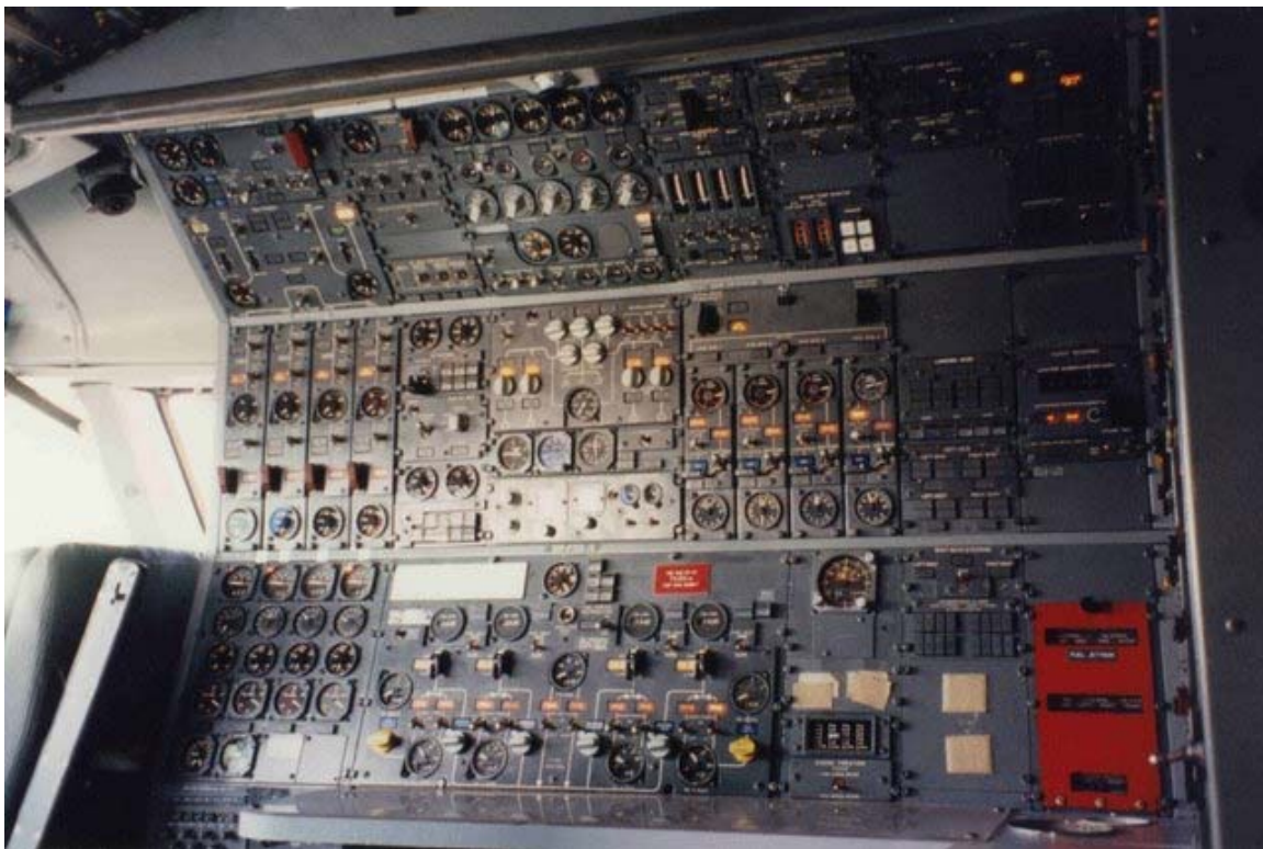
B747-131 Flight Engineer Panel ~ A Bygone Era

So, until next month, be sure to “Think Right to FliRite!”